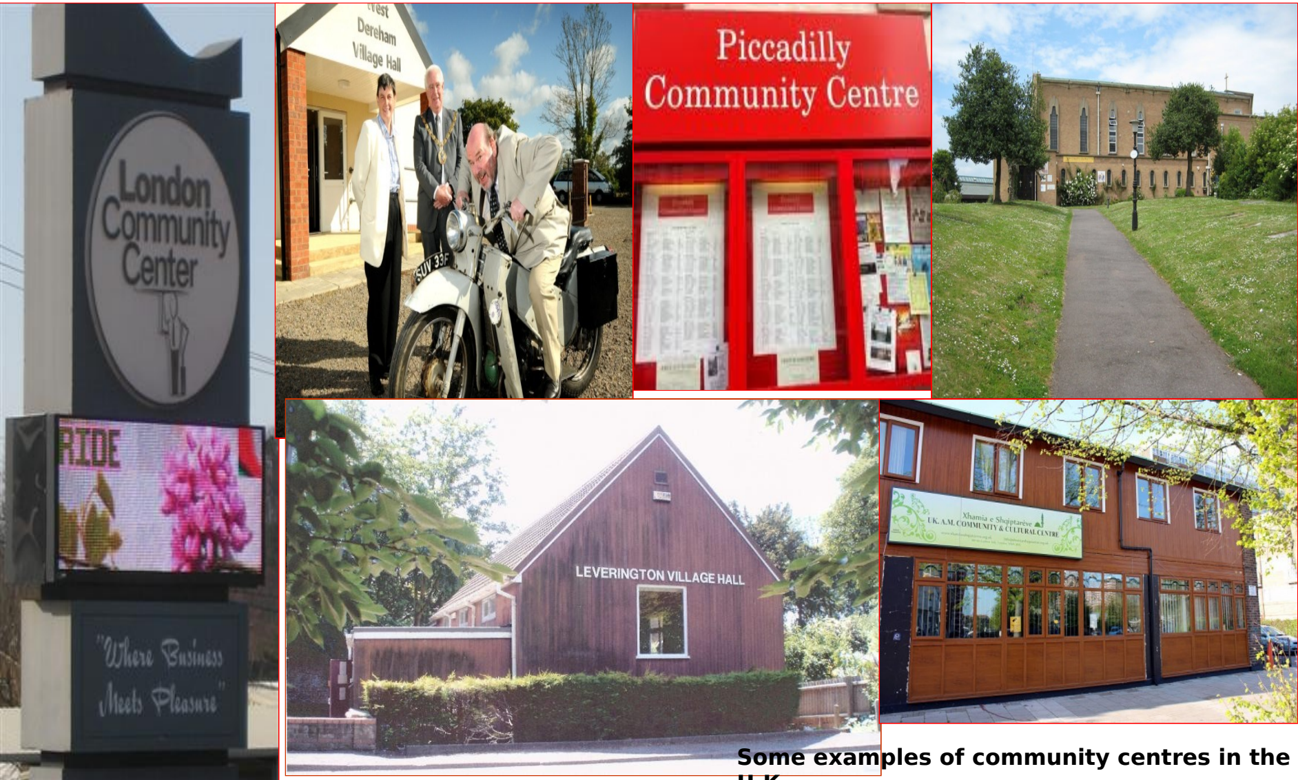
Some examples of community centres in the U.K